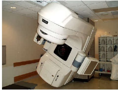
Radiation Therapy Machine

The current spiritual status is another matter. I am soaring as if with the eagles and ever mindful of my blessings. I want to review some of them in an effort to praise God, creator of all that is, author and finisher of our salvation, the only true door to heaven, who takes time to love even me and who answers the prayers of His people. In the beginning I was told that I may face surgery so radical that I would lose my voice box, could have paralysis of the face, and loss of most of the tongue. After prayers and further tests I was still told that radical surgery was still possible and that speech impediment was highly probable. I was told that there is an excellent center in Cincinnati that could help with the speech rehab. People kept praying, God answered. My surgery turned out to be rather modest compared to the previous prognosis and I talked so much afterwards that the surgeon was concerned that I might pull some stitches! God is Good! The surrounding tissue showed cancer free and this initial elation quickly crashed with the report that the cancer had invaded a vessel. Radiation follow up was advised. People kept praying, God answered! The statistics of surviving at least 5 years were about 75% with no fol-