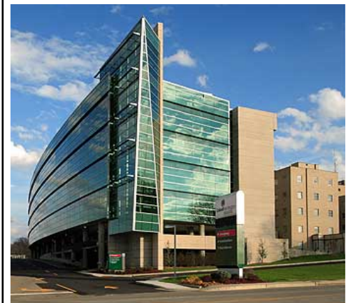
Edward's Comprehensive Cancer Treatment Center